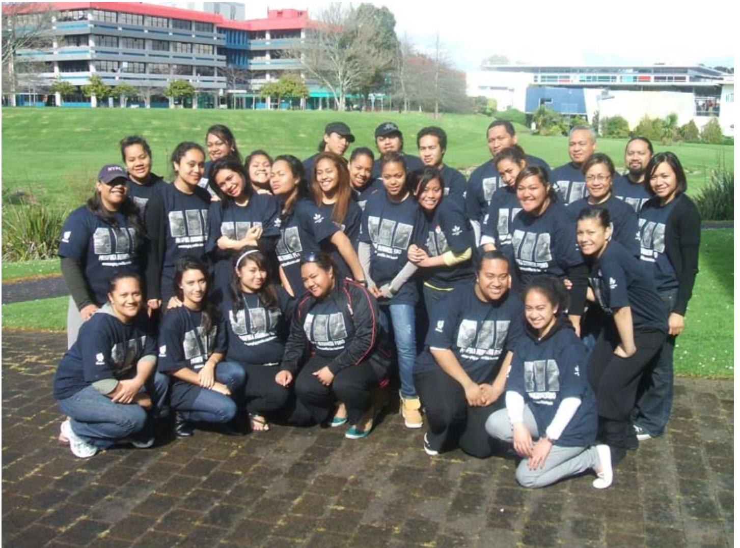
Students who participated in the 2007 Pasifika Business Fono

In 2007 the Pasifika Business Fono successfully completed its first year. The secondary schools business challenge is a two day collaborative partnership with Unitec designed to inspire senior students to consider business and entrepreneurship as a viable career option. The challenge involved business presentations from six teams made up of 22 students from seven secondary schools from the Waitakere and Central Auckland regions. The winning team was from Marist Sisters College in Mt Albert with Auckland Girls Grammar finishing runners up. Unitec scholarships were awarded to members of the winning team. The event was delivered in partnership with Unitec Business School, Pacific Business Trust, and Pacific Media Network.