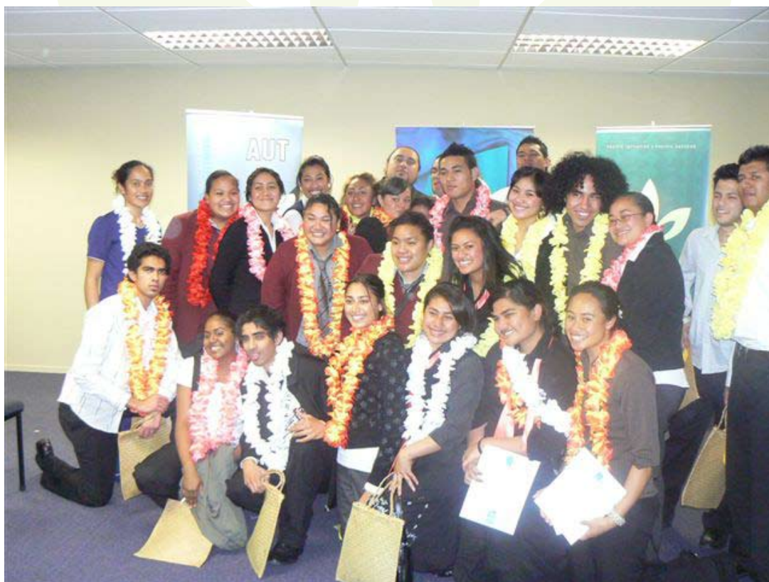
Students who participated in the 2007 Plantation Business Challenge

Competing schools included: Manurewa High School, Mangere College, McCaughly Girls School, Edgewater College, Papatoetoe High School and Sir Edmund Hillary Collegiate.